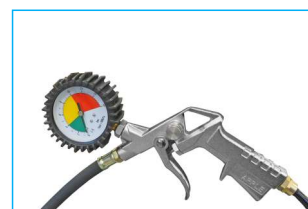
Gun with pressure gauge