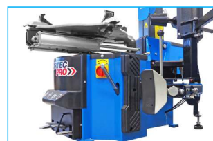
Strong bead breaker with a force of 3 tons