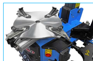
Profiled assembly table from 10" to 24"