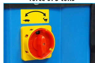
Double speed rotary table, controlled in a switch